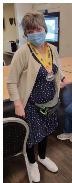
Medals awarded at Paul's Place!